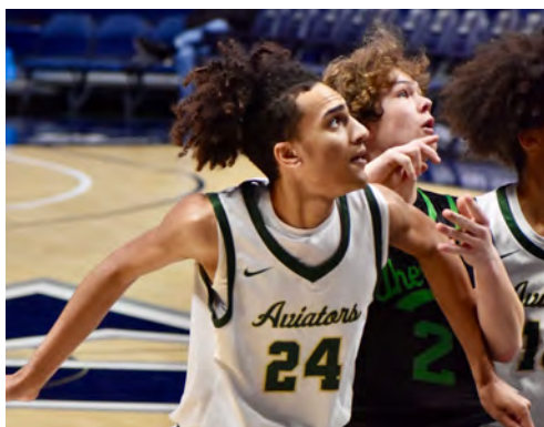
Sycamore vs. Harrison