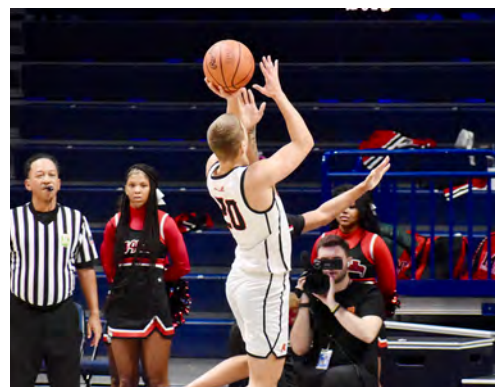
Anderson vs. Mt. Healthy