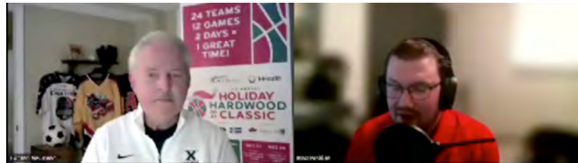
CLICK ON IMAGE TO WATCH THE 19 ON THE CLOCK PODCAST