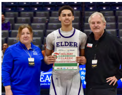
Elder