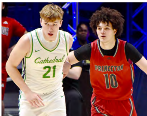
Princeton vs. Indianapolis Cathedral