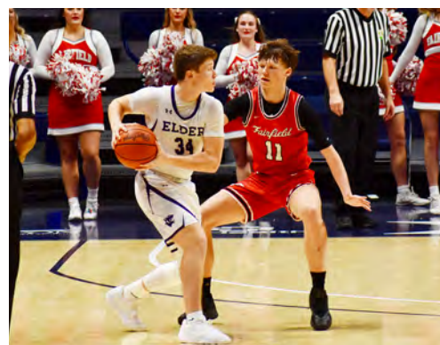
Elder vs. Fairfield