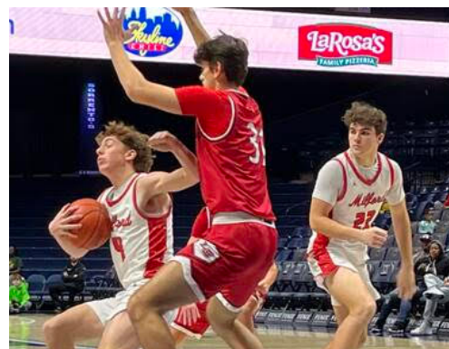
Milford vs. La Salle