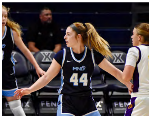
Mt. Notre Dame vs. Bellbrook (Girls)