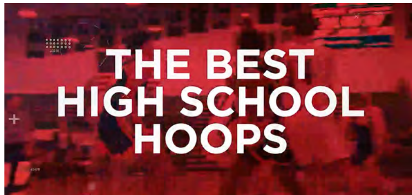
CLICK ON IMAGE TO WATCH THE :30 PROMO