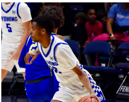
Wyoming vs. Mariemont