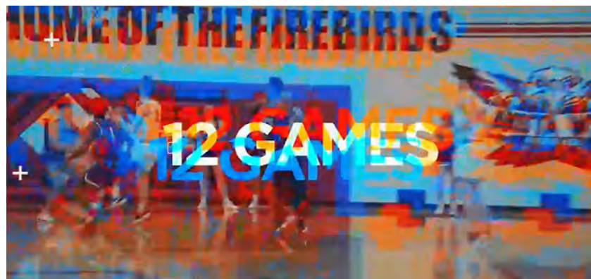
CLICK ON IMAGE TO WATCH THE :15 PROMO