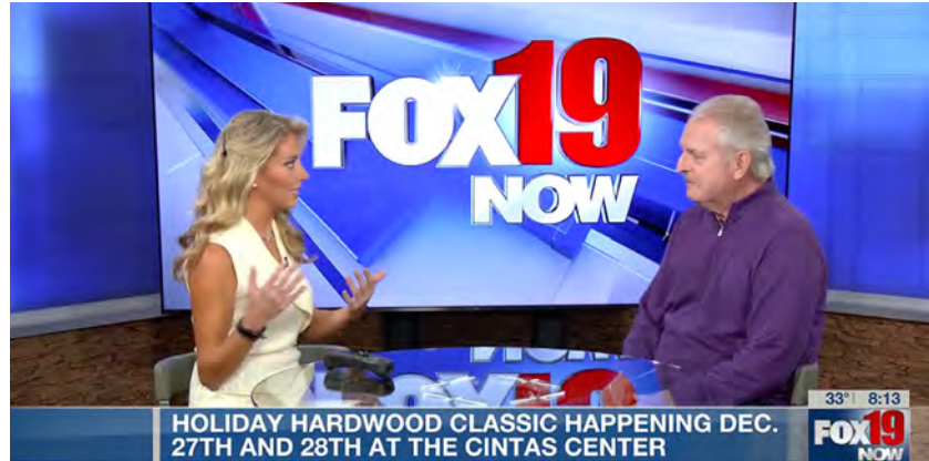
CLICK ON IMAGE TO WATCH THE INTERVIEW