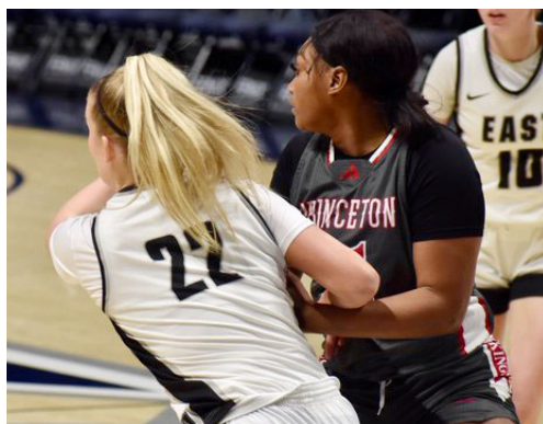
Princeton vs. Lakota East (Girls)