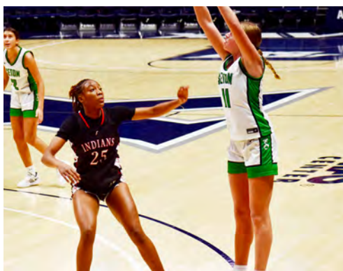
Seton vs. Fairfield (Girls)