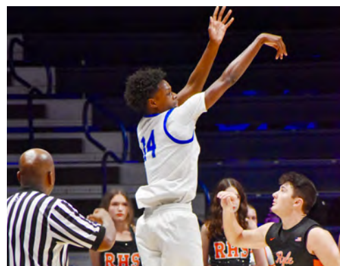
Ryle vs. Summit Country Day